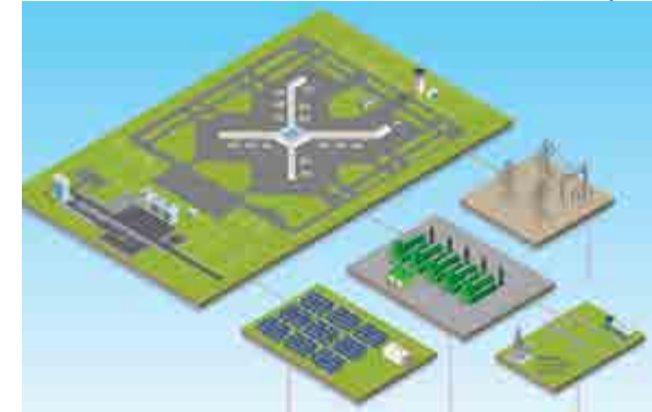
The microgrid will be fueled in part by the airport's own natural gas wells and nearly 8,000 solar panels across eight acres.

Pittsburgh International Airport also announced another first in 2019: to become the first airport to be completely powered by its own microgrid on property, which will bring power resiliency and redundancy to enhance safety and ensure continued operations for passengers.