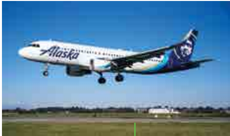
Cost Per Enplaned Passenger

The Allegheny County Airport Authority receives no local taxpayer funding. Its revenue is generated through parking, concessions, real estate development, natural gas royalties and other user-generated dollars.