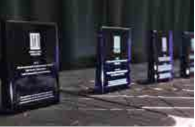
PIT and the ACAA recycled 21,795 lbs of electronics in 2019.